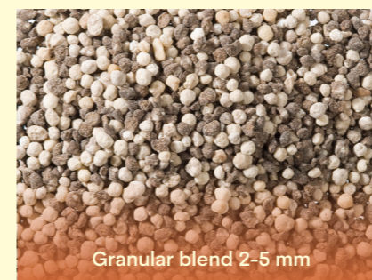
Granular blend 2-5 mm