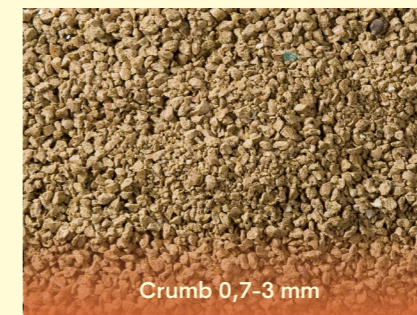
Crumb 0,7-3 mm