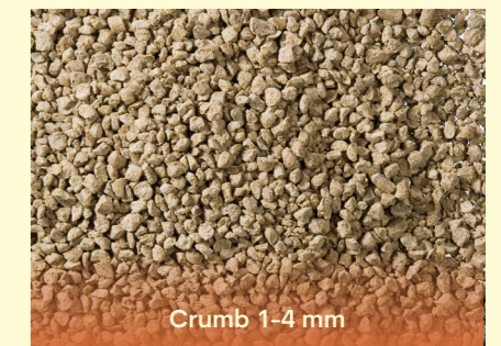
Crumb 1-4 mm