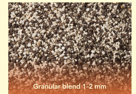
Granular blend 1-2 mm