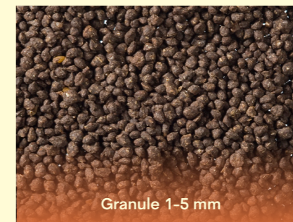
Granule 1-5 mm